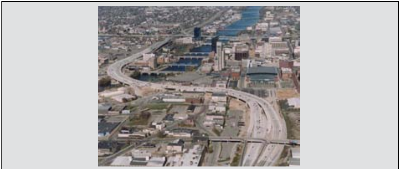
Figure 6. Grand Region, US 131 Grand Rapids S-Curve Replacement.