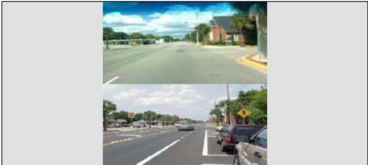
Figure 2. Edgewater Drive, Before and After Restriping.

Orlando is Florida's fifth largest city, population-wise, with more than two million residents living in the Greater Orlando metropolitan area. (City of Orlando 2011) In addition, Orlando receives millions of visitors per year who travel to nearby parks, including Disney World and Sea World.