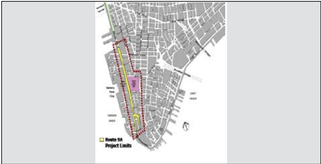
Figure 3. New York Route 9A

This reconstruction project spans a 5.7-mile section of Route 9A (also known as the West-side Highway), which extends along the Hudson River waterfront between Battery Place and 59th Street. The multimodal project includes a street-level six- to eight-lane north-south boulevard and a continuous bikeway and walkway, and it accommodates cars, trucks, buses, bicycles, pedestrians, and various recreational users. Average daily two-way traffic volumes range from 69,000 to 81,000 motor vehicles, demonstrating the importance of Route 9A to this metropolitan region (Eastern Roads, n.d.).