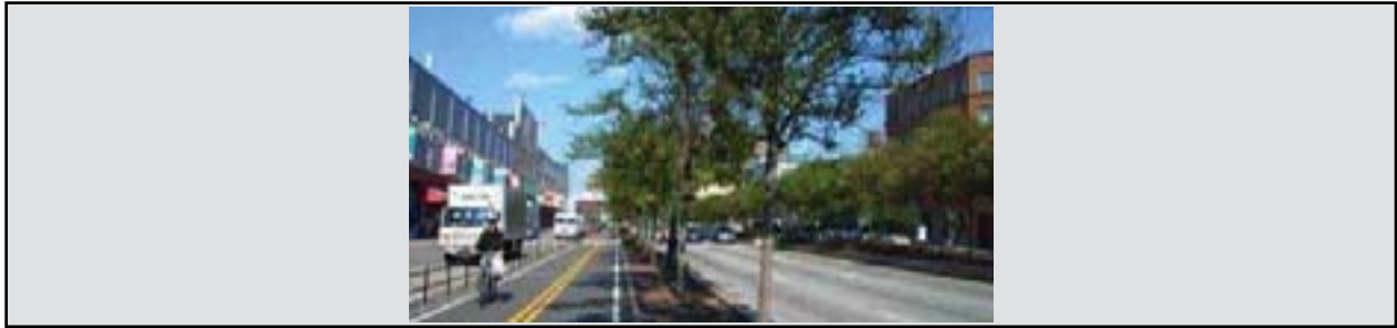
Figure 4. Joe DiMaggio Boulevard

With the closure and demolition of the elevated West Side Highway, the New York City DOT estimates that as many as 10,000 vehicles per day were diverted to Manhattan's other north-south routes, further taxing the capacity of these already congested roadways. The main goal of the Route 9A reconstruction project has been to address the problems associated with the continued use of the interim roadway and to accommodate some of the traffic diverted to other streets in the area when the elevated roadway closed.