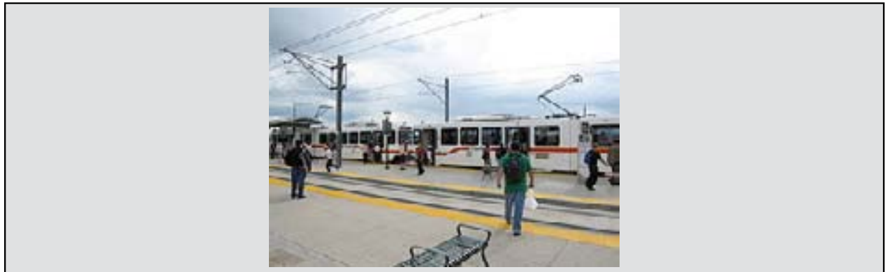
Figure 5. The T-REX Rail Line, Parallel to the Highway

The population growth rate of Denver's metropolitan region has consistently outpaced the national rate every decade since the 1930s. The region grew steadily in the past 10 years, averaging 1.9 percent population growth each year from 1999 to 2009. The current population exceeds 2.8 million people, and by 2030, it is anticipated to increase to almost 3.8 million (MetroDenver, n.d.). The T-REX project, which includes the "Southeast Corridor" in the Denver Metro area, connects the bustling downtown Denver Central Business District and the Southeast business district. These two major employment centers concentrate more than 180,000 people on a daily basis, plus approximately 30,000 additional workers employed along this corridor, which is expected to continue to grow over the next 20 years (RTD, 2007).